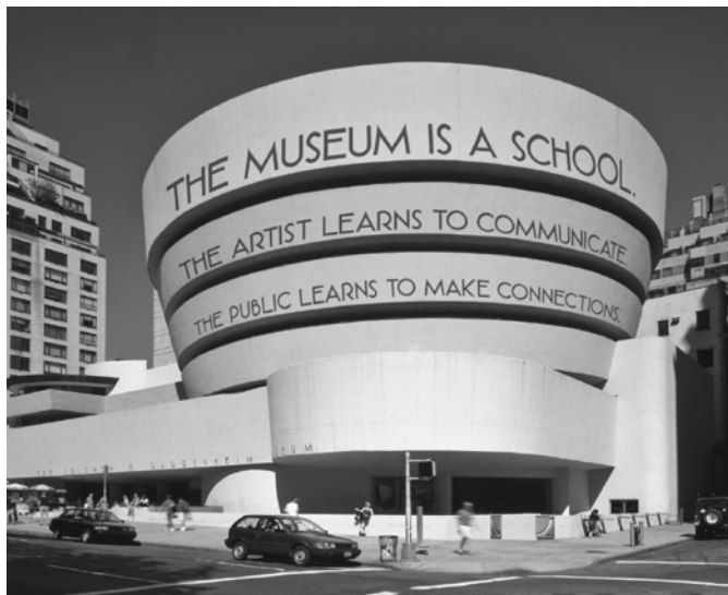
A Museum is a School, 2009-

Leisure is just a work-supporting device. And within that idea of leisure, art is ranked at the lowest level, a sort of leisure-within-leisure or sub-leisure distraction. I think one of the problems is that education is still based on mastering what is known rather than exploring what is not known. In that sense, education is constructed on the past and art is considered a part of that past, with little practical application in a society that is focused on instrumentalisation. But, if art is a metadiscipline for cognition, it is the only one that can enable us to explore the unknown future and look for tentative - or what Stuart Hall called 'ephemeral' - closures. This kind of art would help us to continually disarticulate and rearticulate those systems that currently seem so permanent and oppressive. I would not call that leisure. I would call it trying to survive.