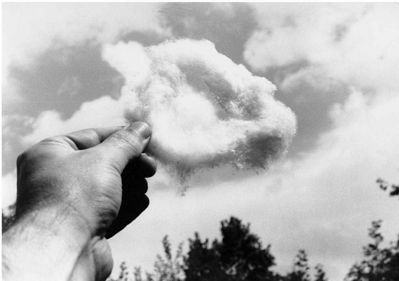
The discovery of geometry, 1978